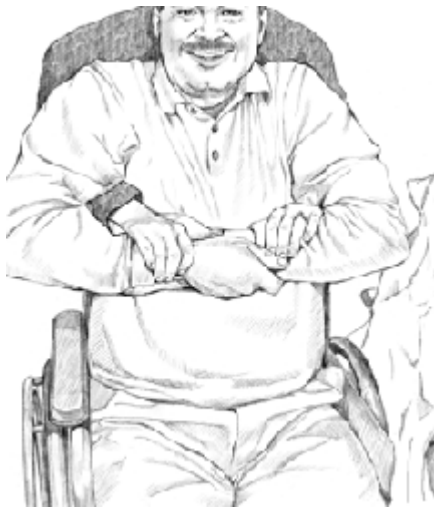
First clinician stands behind the patient.